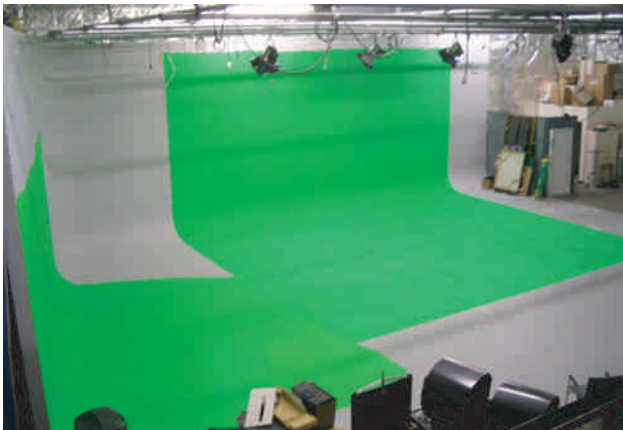
LMA Productions Stage